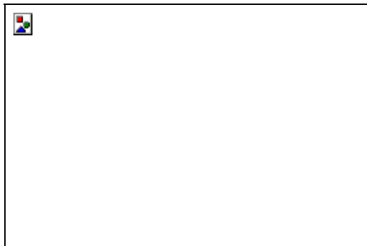
Secretaries' day in the bar.